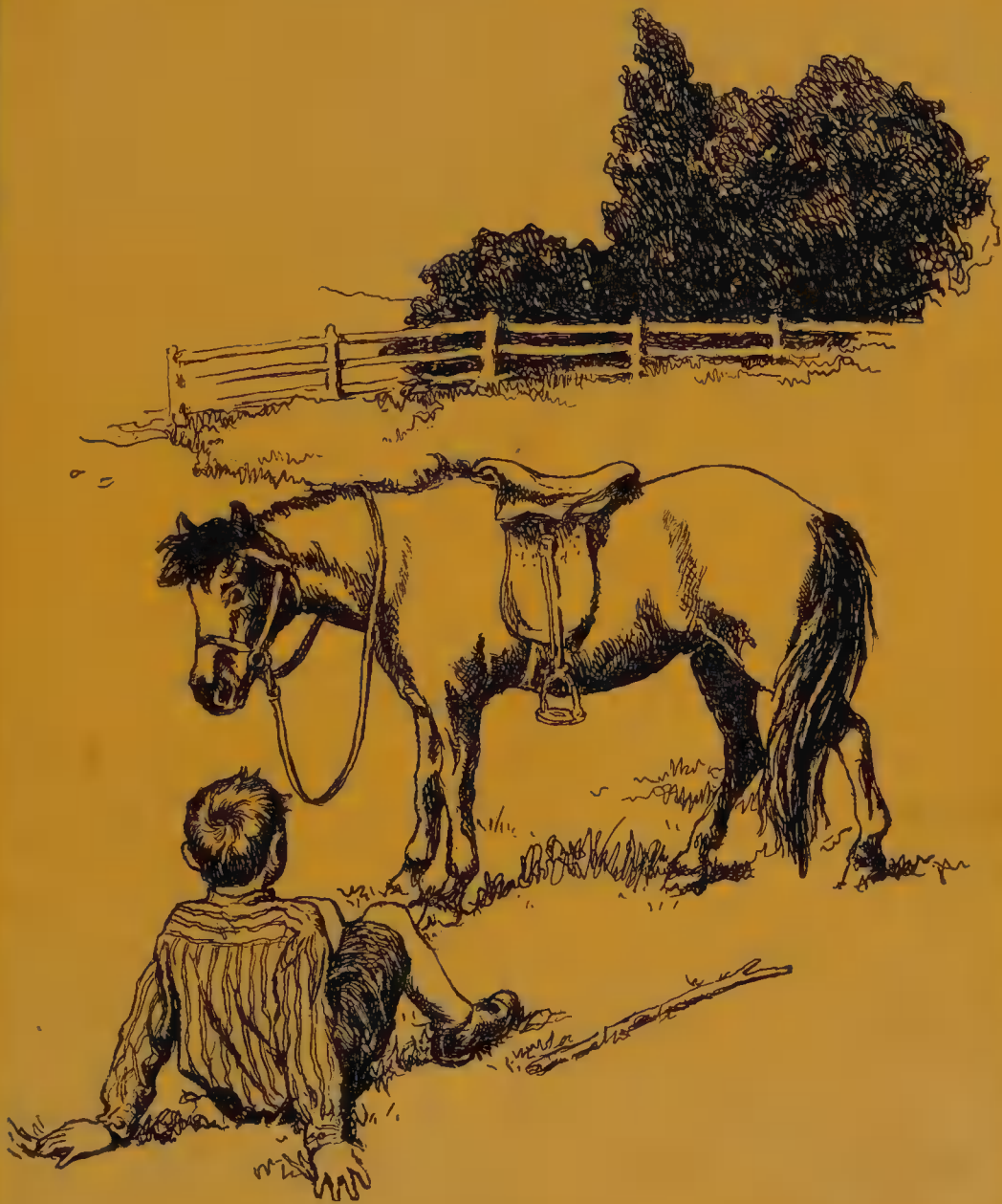
As soon as he began to use his stick I laid him on the grass